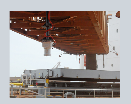
The weather in Pilbara is very dry and hot, so video technologies and Lidar sensors are adversely affected by dust. Navtech's sensors operate flawlessly in all environments and designed to be maintenance free for 10 years,