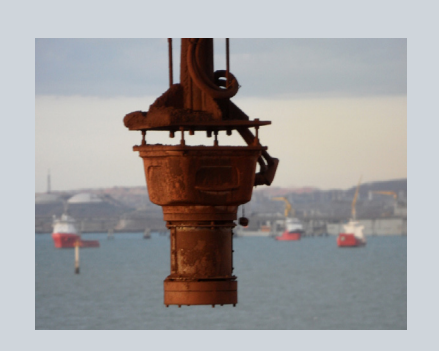
The sensors are capable of working automatically year round with no cleaning required. The operator is aided in his duties and any potential risks are mitigated as the radar identifies them and the operator reacts accordingly.